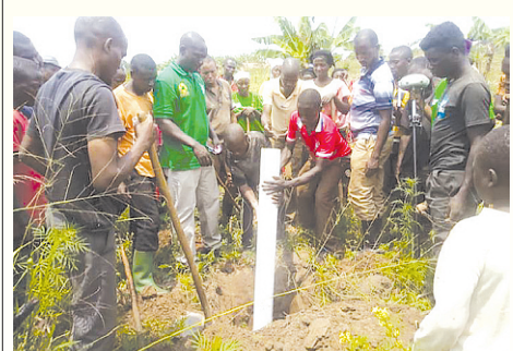
Figure 2. Refugees participating in the demarcation of Kakoni Wetland in Kyaka II refugee settlement.

Civil society have utilized the presidential directive to evict encroachers in wetlands to engage communities; supported communities to develop wetland management guidelines, form wetland management committees and demarcate wetlands. As a result, 1,500 ha of degraded wetlands have been restored , with installation of concrete pillars at the highest water mark of the wetland, in some instances bamboo seedlings were planted at an interval of 5 meters in between the concrete pillars.