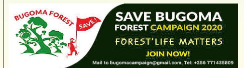
Figure 3. Banner of the Save Bugoma Forest Campaign.

The main governance concerns this year has been the giveaway of part of Bugoma CFR. The ENR CSOs responded to this with a 'Save Bugoma' initiative where CSOs have concentrated efforts engaging different sector actors to address concerns related to management responsibility of the contested area, court cases related to ownership of the land, concerns over the process of issuance of the Environment and Social Impact Assessment Certificate among others.